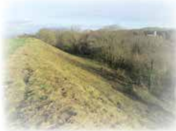
④ The ramparts of the Iron Age hill fort – scrub has recently been cleared by volunteers who now maintain the grassland by annual scything.