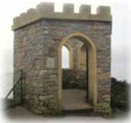
① The Lookout (recently rebuilt) – originally built ca 1835 for the sugar merchant Conrad Finzel and now popularly known as the Sugar Lookout.