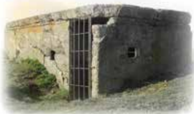
⑤ World War II shelter – now gated, popularly known as the Pill Box.