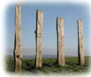
③ The Tennyson posts ('darkened heart' sculpture) – erected 1994 with lines from the poem In Memoriam A.H.H. completed 1849 after the death of the poet Tennyson's friend Hallam.